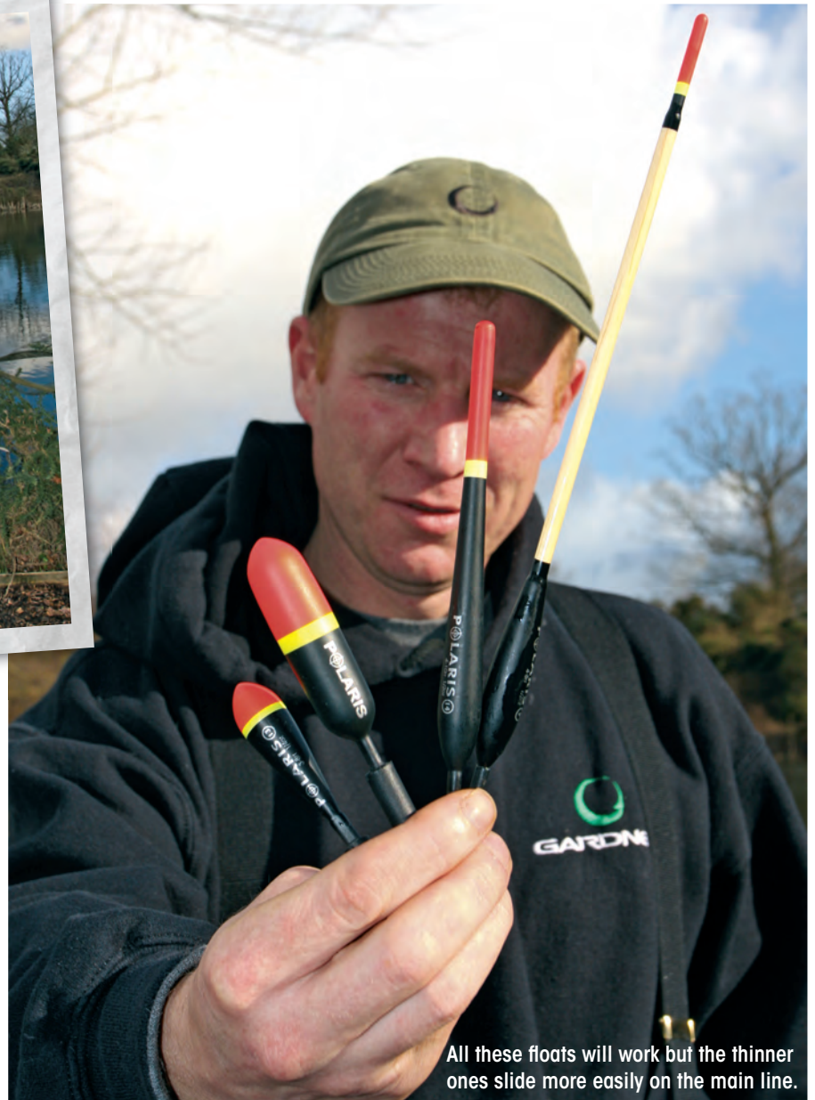
All these floats will work but the thinner ones slide more easily on the main line.

The only drawback with Polaris floats is that range is limited. I have found that you can only really use them effectively with an underarm cast. If you cast overarm, the float can slide too far up the line. If you are fishing in eight feet of water and the float slides up 15 feet, it will give you a diagonal line lay, which is not what you want. With the underarm cast the float tends to stay put until the lead hits the bottom. You can then slacken off the line and the float will rise to the surface. In reality, you are limited to a range of around 30 yards.